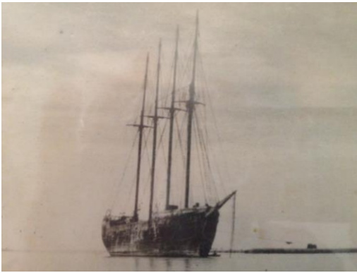
SS Chiquimula, part of the US Army lumber fleet

The SS Chiquimula was a four-masted Blue Water Schooner, tonnage 700 (gross); 615 (n) with dimensions of 176.3 ft. x 36.1 ft. x 14.2 ft. Built in 1918 in Portland, Oregon , her home port was San Juan, Puerto Rico . Her final resting place, beached at mouth of Blakely River , east end of Mobile Bay Bridge Causeway, Baldwin County side. There, a landmark for 13 years until 1953.