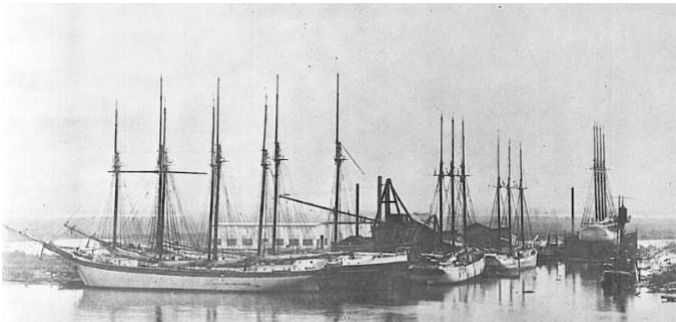
Three- and four-masted schooners at Mobile, ca. 1900

Vessels known informally as “blue water” schooners were ocean-going freight carriers, much larger than the coastal schooner-rigged fishing vessels, but still among the smaller sailing freighters of the time. These were much longer, narrower than similarly rigged fishing craft, construction dates ranging from 1838 to 1919. One of the latest of these, the large four-masted Chiquimula , was originally motor powered, only later converted to sail.