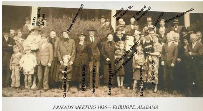
FRIENDS MEETING 1936 -- FAIRHOPE, ALABAMA

forty-four moved, ages from two years old to eighty, all by individual decision and action, not sponsored by the Friends. Today, Fairhope Friends Quakers continues and the Fairhope Friends Quakers Cemetery holds 115 grave sites.