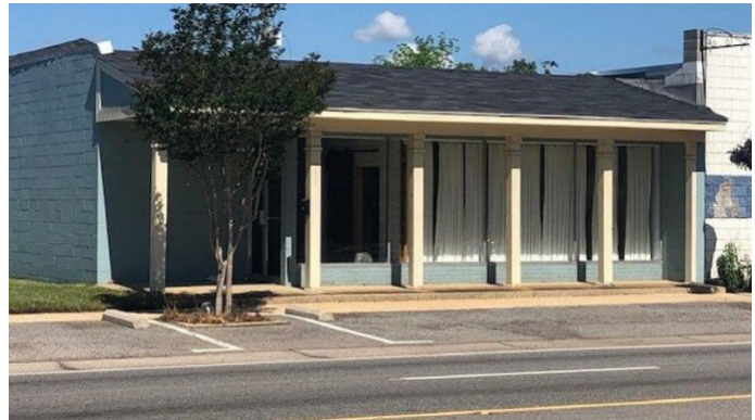
Foley Onlooker building as it looks today on N. McKenzie St. one block north of Highway 59 & 98 intersection