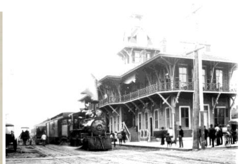
Volanta Hotel with twin village of Sea Cliff (overlooking Mobile Bay), both north of Fairhope today the hotel is private home owned by Mashburns